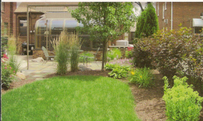
RESIDENTIAL LANDSCAPE RECONSTRUCTION $25,000 - $50,000 English Gardens, Brail Residence