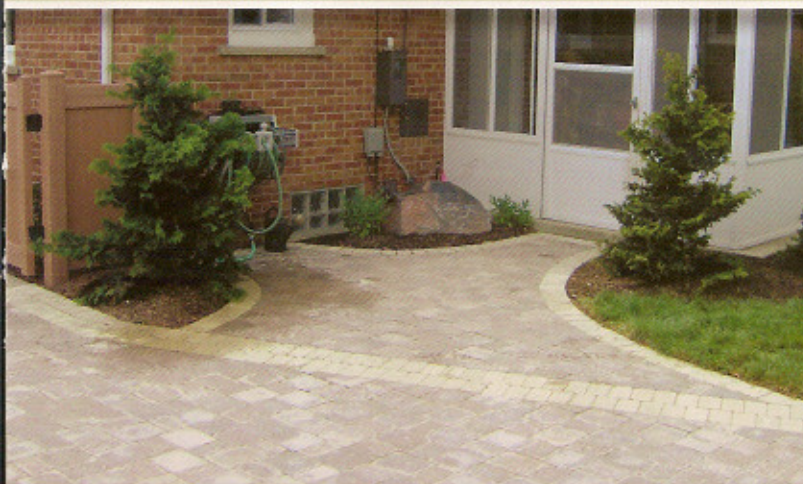
RESIDENTIAL LANDSCAPE RECONSTRUCTION $25,000 - $50,000 English Gardens, Harrison - Mitchell