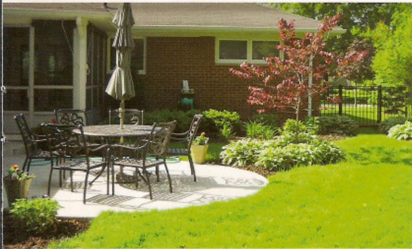
RESIDENTIAL LANDSCAPE RECONSTRUCTION $10,000 - $25,000 English Gardens, Marion Residence