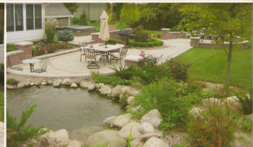
RESIDENTIAL LANDSCAPE RECONSTRUCTION $100,000 - $250,000 Great Outdoors, Borkowski Residence