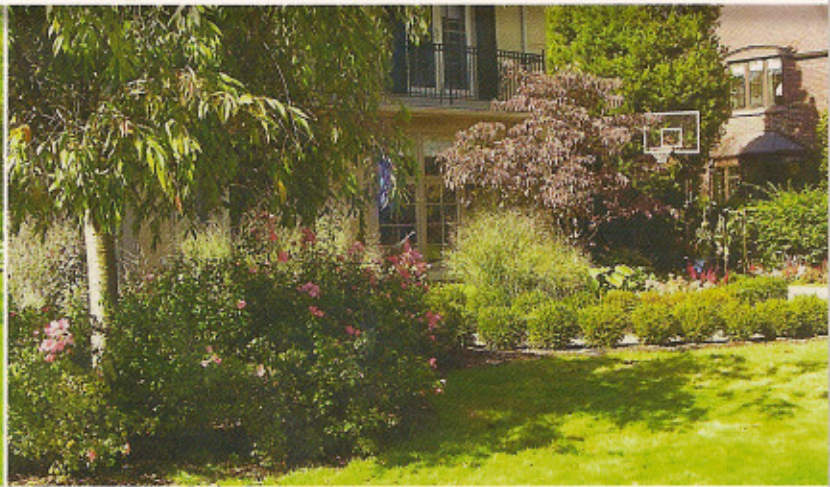
RESIDENTIAL LANDSCAPE RECONSTRUCTION $10,000 - $25,000 Thoms Bros. Landscaping, Inc., Grosse Pointe Park Residence