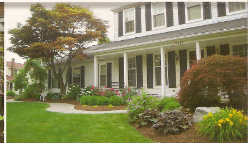
RESIDENTIAL LANDSCAPE RECONSTRUCTION $25,000 - $50,000 English Gardens, Braun Residence